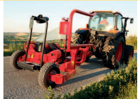
The loading arm is powered fully down to lift the wheel off the ground for easy movement from work to transport.