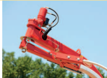
Strong satellite driveline.