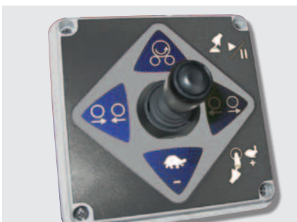
... and mini-joystick controlling the main functions.