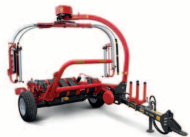
Vicon BW 2850 Satellite wrapper, trailed Max bale size: 1.20x1.50m