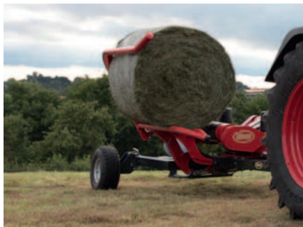
Hydraulically operated loading arm, and a low loading height, provides fast transfer of bale from arm to turntable.