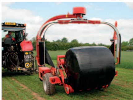
Fast and gentle unloading of bales with no need for a drop mat.