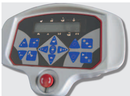
Monitor for the programming and control of the full wrapping cycle ...