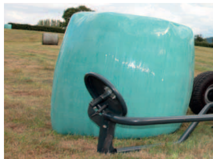
The Vicon BW 2850 can be fitted with a bale on end kit. The bale is tipped off gently without damaging the film wrap.