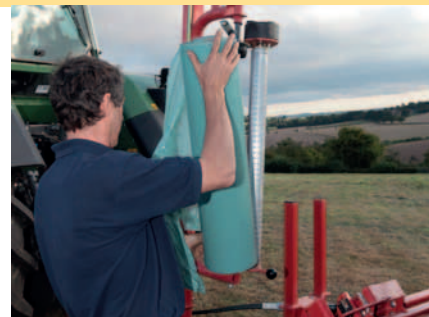
Easy change of film roll.