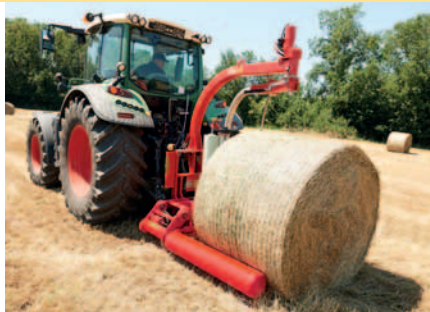
Self-Loading of bales – The BW 2250 has a self-loading mechanism to gently load and unload the bales.