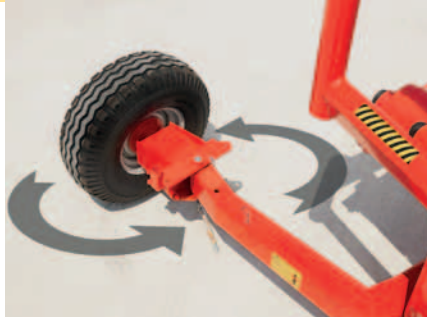
To achieve a narrower transport width, the right hand wheel is turned to the inside of the support arm.