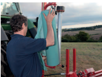
Easy change of film roll.

Low lifting height of the film rolls is achieved thanks to the low profile design of all Vicon bale wrappers.