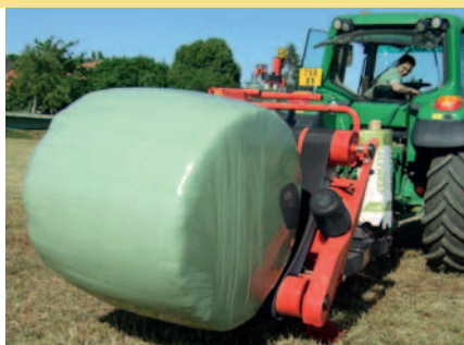
Low table height for fast and gentle unloading.