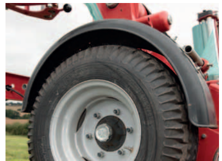
Mud guards reduce mud and dirt building up on the pre-stretcher and film rolls when operating in soft ground field and during transport.