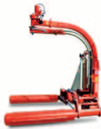
Vicon BW 2250 Satellite wrapper, mounted Max bale size: 1.20x1.50m