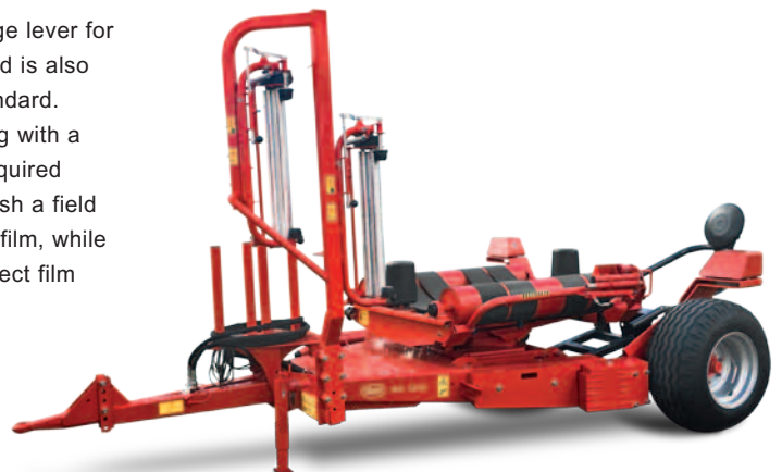
DuoWrap twin film pre-stretcher.

A simple ratio change lever for the table roller speed is also incorporated as standard. This allows wrapping with a single film where required – for example to finish a field off using one roll of film, while maintaining the correct film overlap.