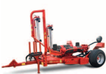
Vicon BW 2600 Turntable wrapper, trailed Max bale size: 1.20x1.50m

Vicon bale wrappers have been designed to offer fast and accurate wrapping of your precious forage crops. An investment in a Vicon bale wrapper is your guarantee of cost effective bale wrapping.