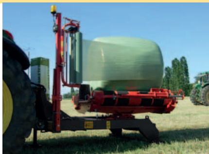
Bale and wrap counter is standard.