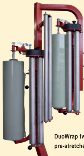
DuoWrap twin film pre-stretcher.