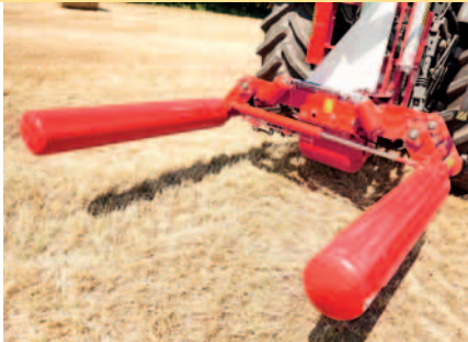
Easy and gentle self-loading of the bales – the bale is gently lifted by the rollers.