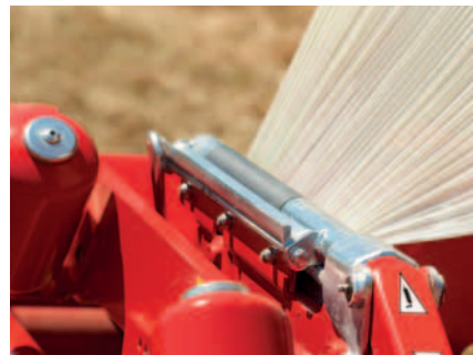
Hydraulic Film Cutter.