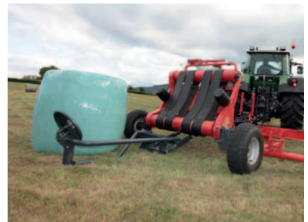
The Vicon BW 2400 can be fitted with a bale on end kit. The bale is tipped off gently without damage to the film.