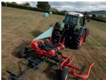
Turntable with two driven rollers designed for high bale stability and smooth even rotation.

The wide spacing of the wheels has allowed an exceptionally low mounting position for the turntable. This allows the table to be tilted downwards until it nearly touches the ground, reducing drop height when unloading bales, ensuring the gentlest possible handling of the wrapped bale. This reduces the chance of film damage and eliminates the need for a fall damper or drop mat in normal conditions.